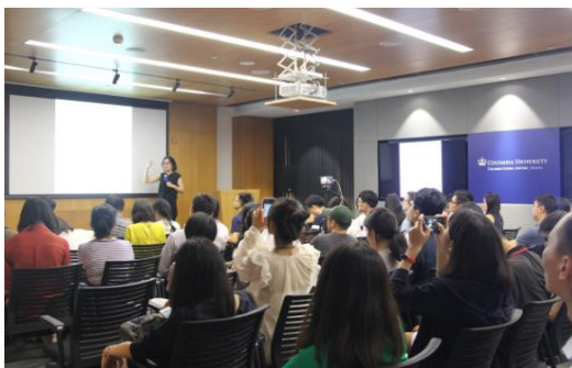
(Photo ID: Weiping 1, Weiping 2) Professor Weiping WU gives a lecture on China's urbanization in the global context at the Beijing Center on June 27.